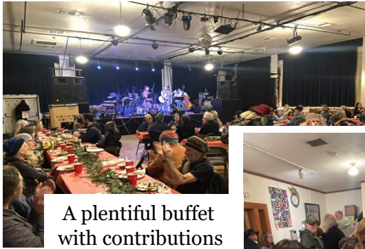
A plentiful buffet with contributions from over 50 restaurants!