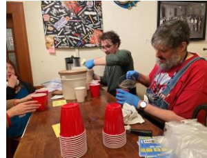
Root beer floats