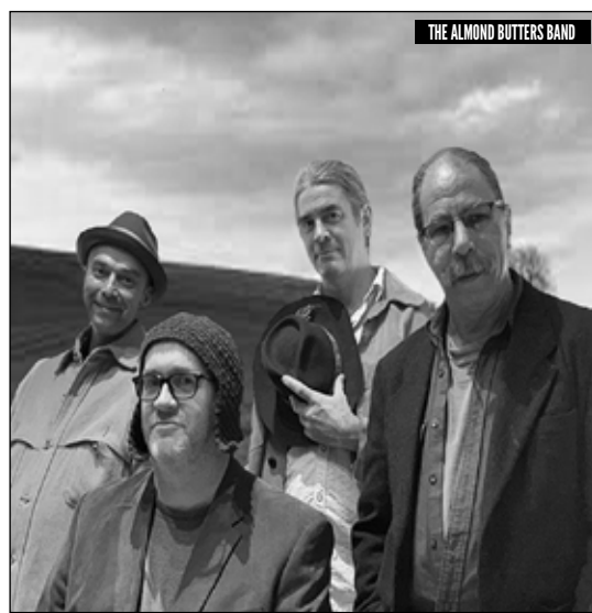
THE ALMOND BUTTERS BAND