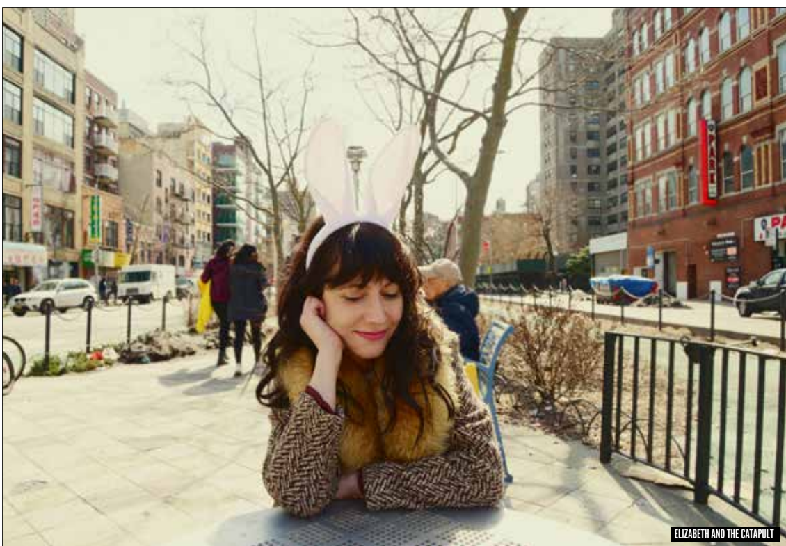
ELIZABETH AND THE CATAPULT

Tickets are $12 advance, $15 day of show, and $70 for a special Soundcheck Party. Doors open at 8:00 pm and showtime is 8:30. This is a fully seated show; first come, first served.