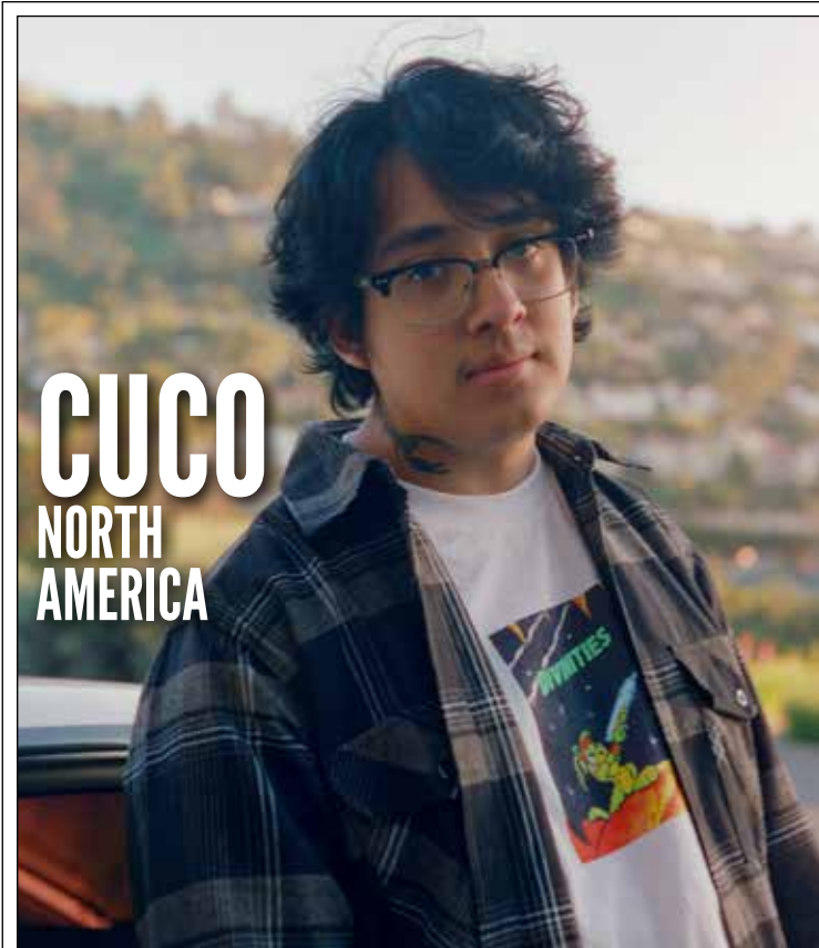
CUCO NORTH AMERICA

On Wednesday, July 17, the Community Center for the Performing Arts proudly welcomes Cuco’s North American Tour to the WOW Hall.