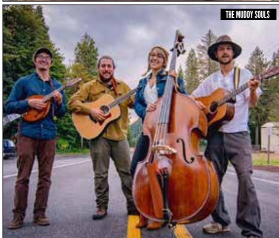
THE MUDDY SOULS