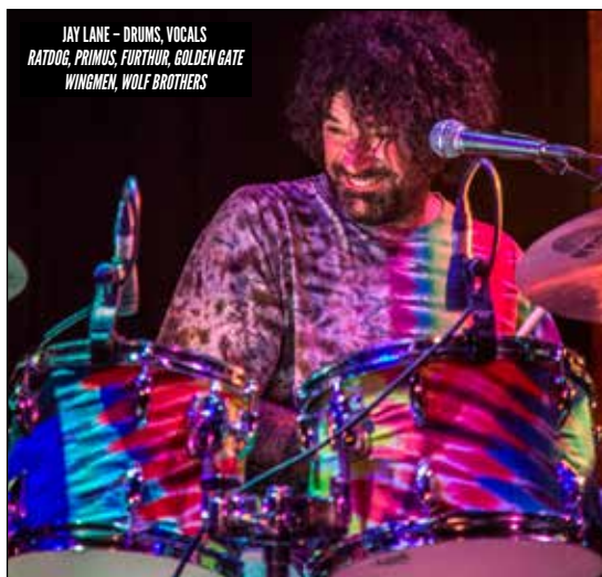
JAY LANE - DRUMS, VOCALS RATDOG, PRIMUS, FURTHUR, GOLDEN GATE WINGMEN, WOLF BROTHERS