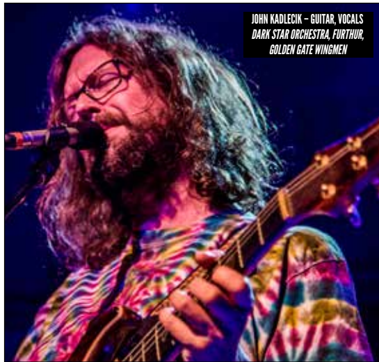
JOHN KADLECİK - GUITAR, VOCALS DARK STAR ORCHESTRA, FURTHUR, GOLDEN GATE WINGMEN

Tickets are $22 advance, $25 day of show. Doors open at 8:00 pm and showtime is 9:00. ★