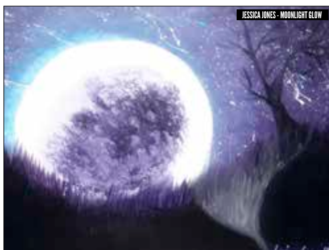
JESSICA JONES - MOONLIGHT GLOW

Tickets are $20 advance, $25 day of show and $79 Meet & Greet. Doors open at 7:00 pm and showtime is 8:00. ★