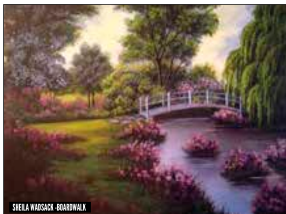
SHEILA WADSACK - BOARDWALK