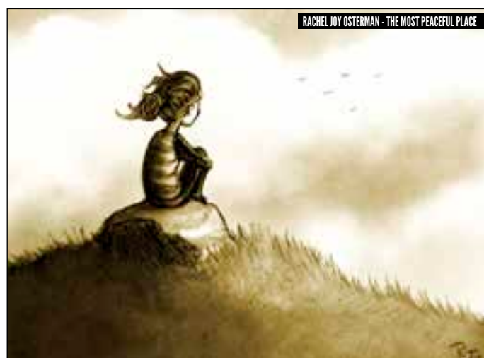
RACHEL JOY OSTERMAN - THE MOST PEACEFUL PLACE