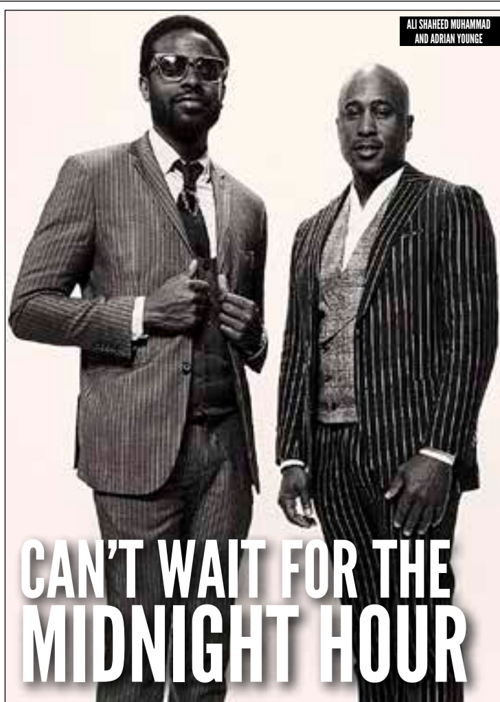
ALI SHAHEED MUHAMMAD AND ADRIAN YOUNGE

If you would like to become a supporting member of the WOW Hall or check your membership status, please call the office at 541-687-2746. Memberships are on a sliding scale, $15 to $40 a year (or more). In addition to free admission to the party, members elect and may serve on the Board of Directors and receive the WOW Hall Notes by mail or email. ★