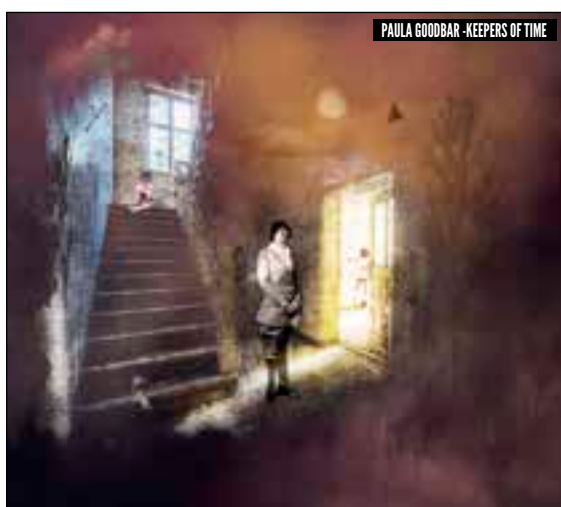
PAULA GOODBAR - KEEPERS OF TIME