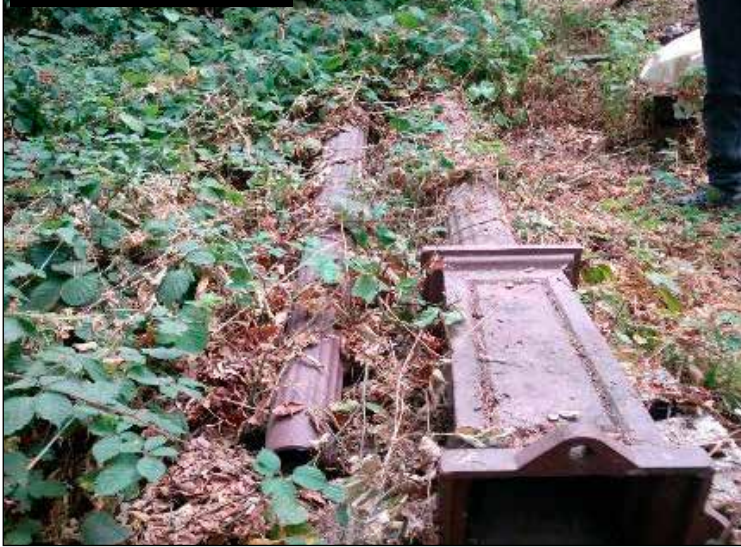
RESCUING HISTORIC STREET LIGHTS

food truck offering homemade tortillas and tantalizing Mexican food.