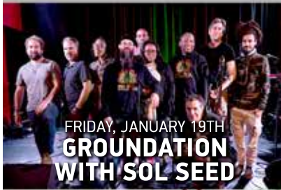
FRIDAY, JANUARY 19TH GROUNDATION WITH SOL SEED